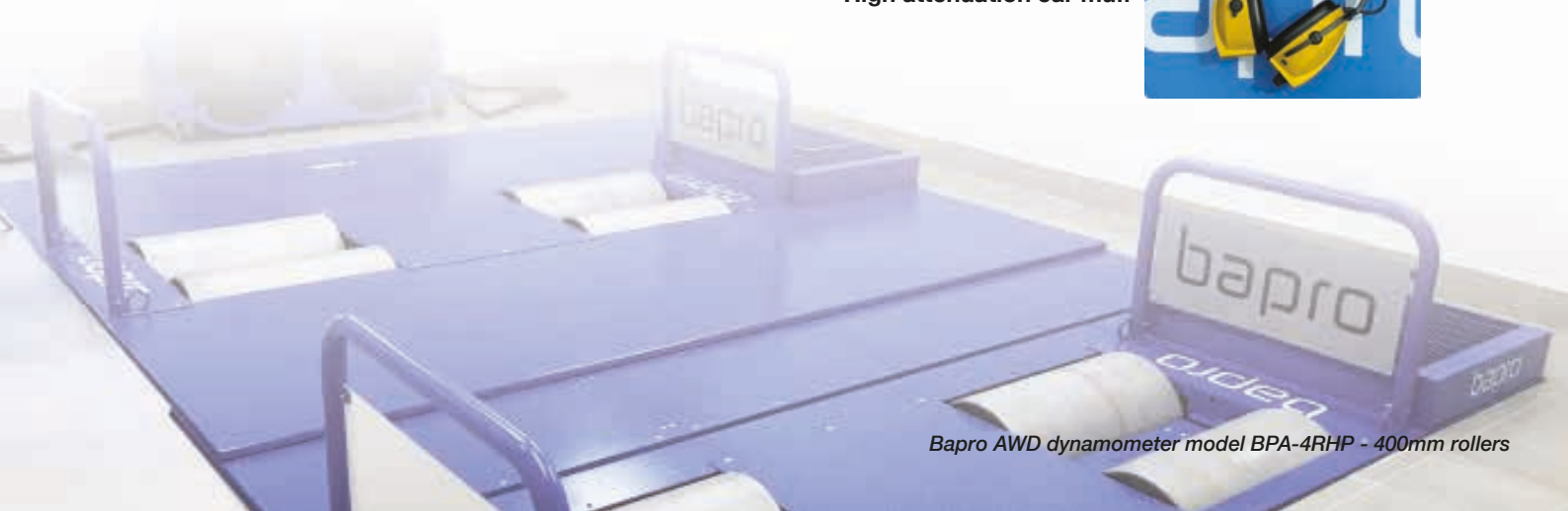
Bapro AWD dynamometer model BPA-4RHP - 400mm rollers